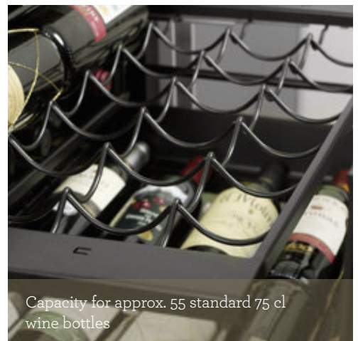
Capacity for approx. 55 standard 75 cl wine bottles

AWARD FOR DESIGN EXCELLENCE NORWEGIAN DESIGN COUNCIL