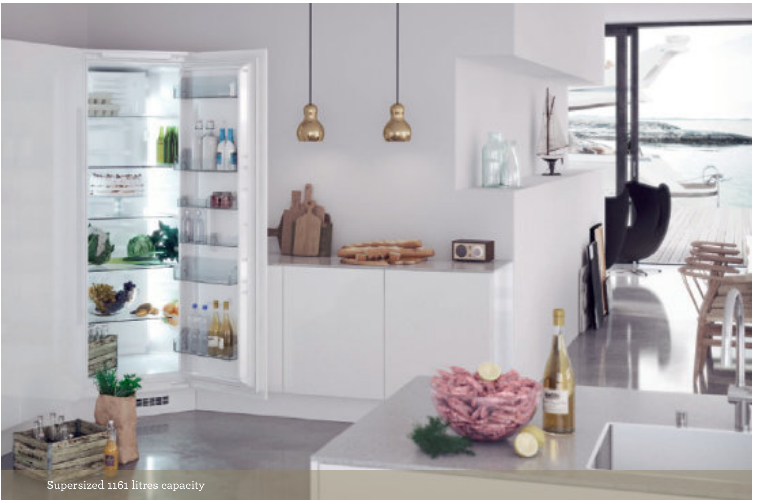
Supersized 1161 litres capacity