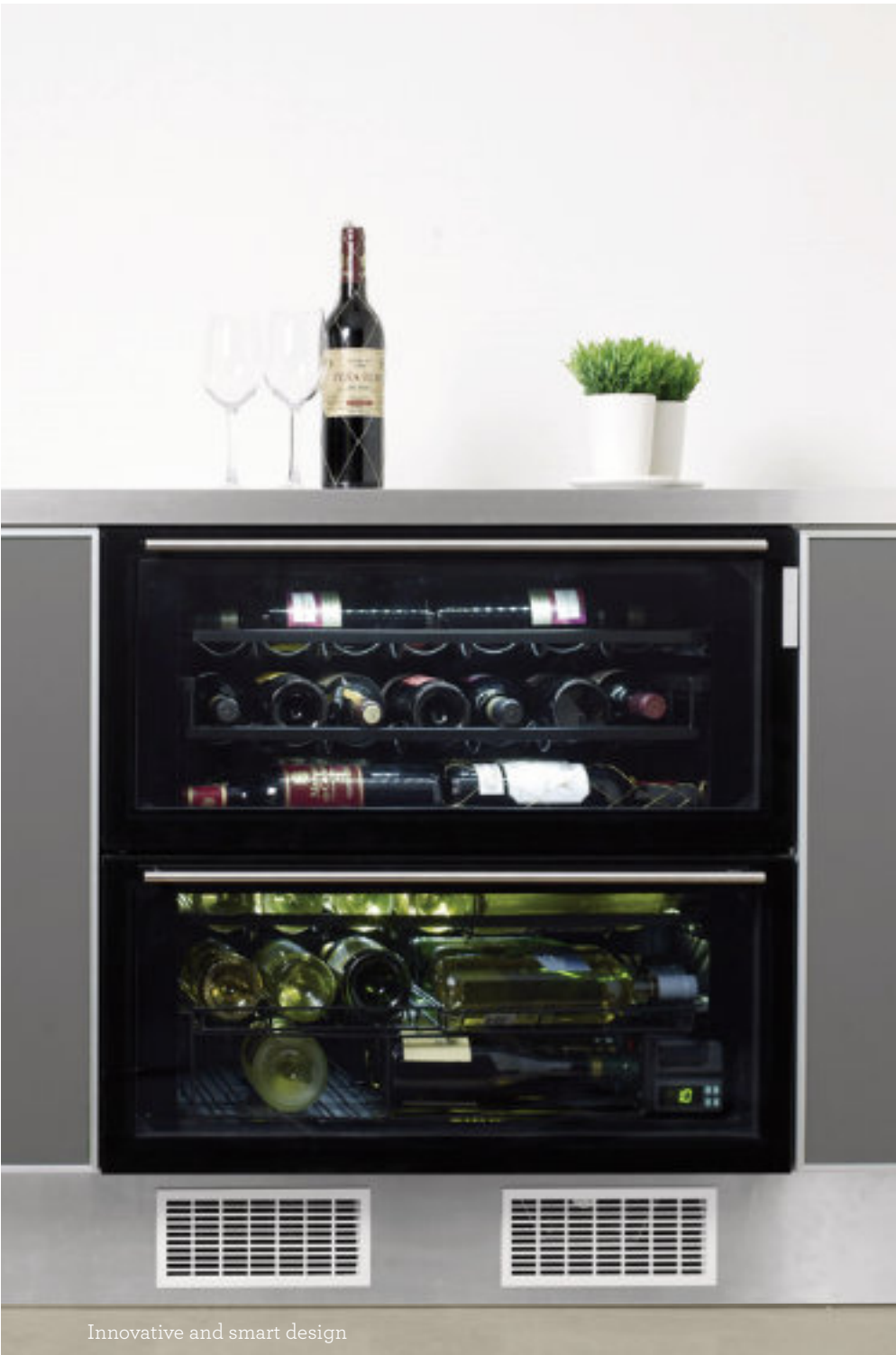
Innovative and smart design