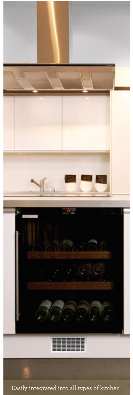
Easily integrated into all types of kitchen