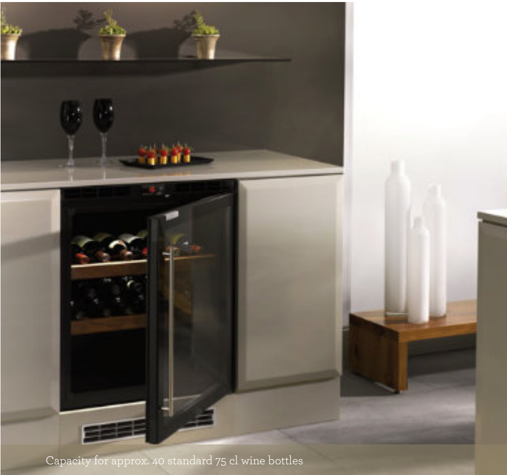
Capacity for approx. 40 standard 75 cl wine bottles