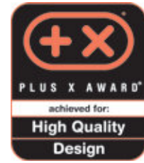
Cave 20 BU