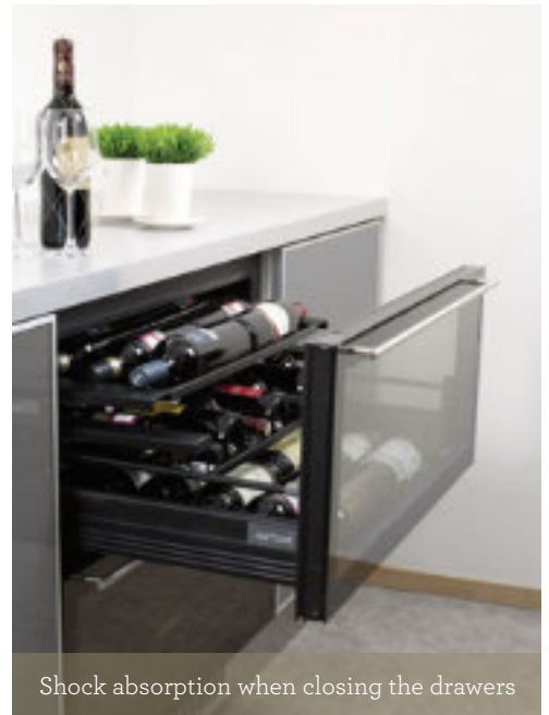
Shock absorption when closing the drawers